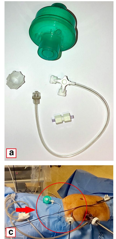
Fig. 1 a Material required for the filtering system I; b system I assembled; c system I in clinical use

Two systems including the same type of filter were developed: the first made use of a male-to-male connector (male-2-male LL, Vygon, Ecouen, France), a 25-cm long Luerlock infusion connector (BD Connecta<sup>TM</sup>, Becton Dickinson, Sweden), an electrostatic filter HME (Heat and Moisture Exchanger) (DARTM, Covidien, Mansfield, MA, USA) with end tidal CO<sub>2</sub> port, and a 15-mm cap for fenestrated inner tracheostomy cannula (Shiley<sup>TM</sup>, Covidien, Boulder, CO, USA) (Fig. 1a-c). The second, a similar device with the same principles consisted of a rubber/Luer-lock connector (AK3100 ref., Coloplast-Porgès<sup>TM</sup>, Denmark), commonly used for infusion of fluids or connecting drainages; a blue connector included in the Rüsch<sup>TM</sup> Breathing kit for ventilators (ref. 191565-201800, Teleflex Medical, Dublin, Ireland), and the same electrostatic filter HME (DAR<sup>TM</sup>, Covidien, Mansfield, MA, USA) (Fig. 2a-c). The key object